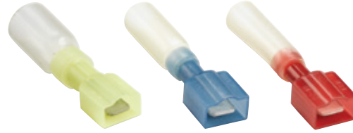
Heat-shrinkable fully insulated male tabs