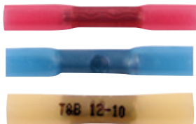
Heat-shrinkable butt splices