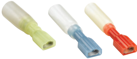
Heat-shrinkable fully insulated female disconnects